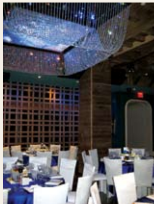
THE SALON INTERIOR