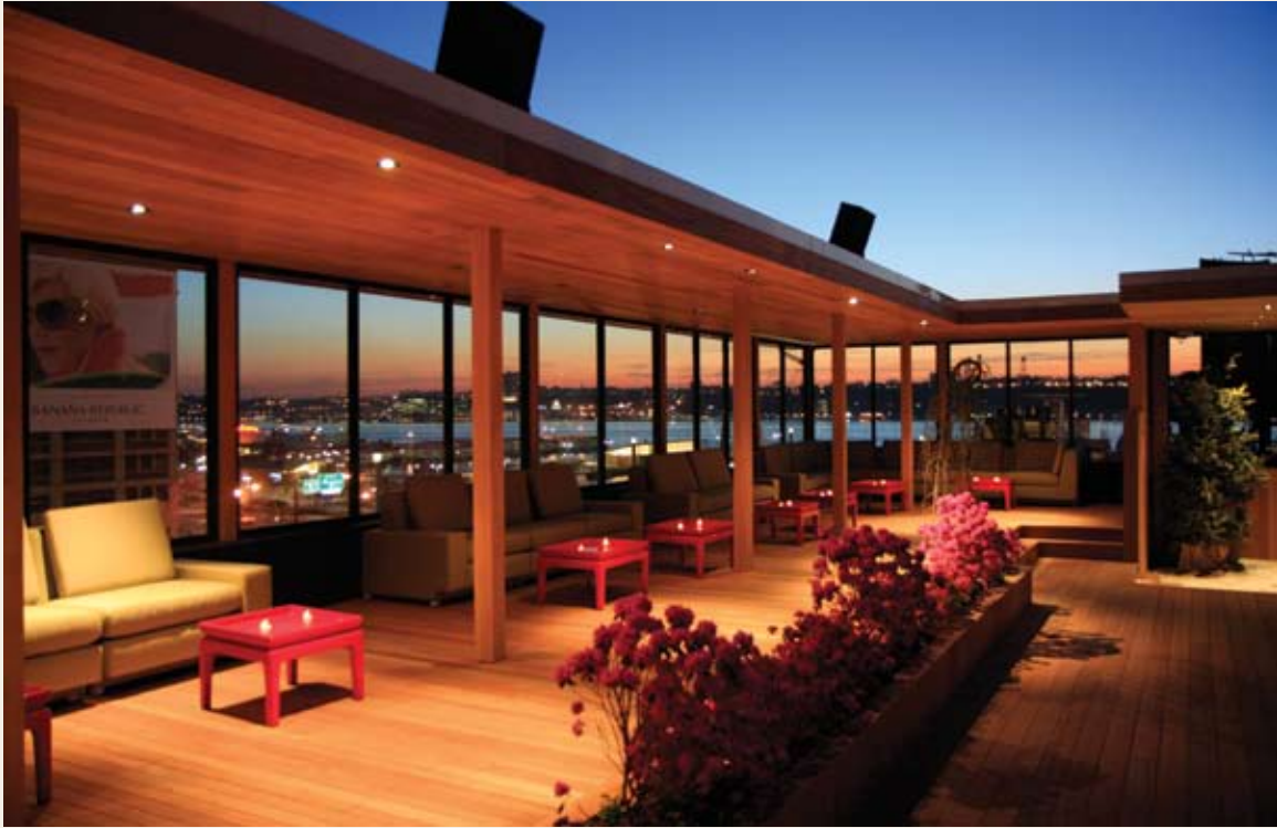
ROOFTOP GARDEN LOUNGE AT NIGHT