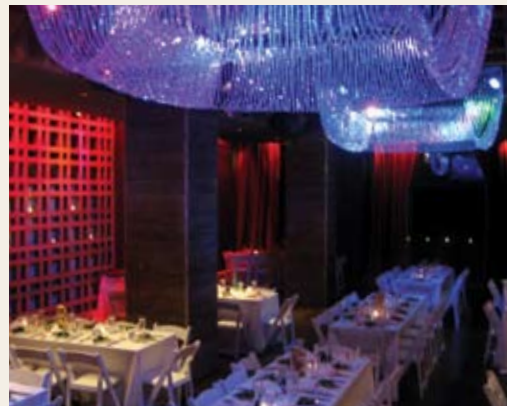
THE SALON INTERIOR