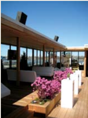
ROOFTOP LOUNGE DAYTIME